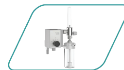
Air & Oxygen blender